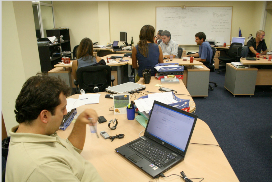
OSS in Development