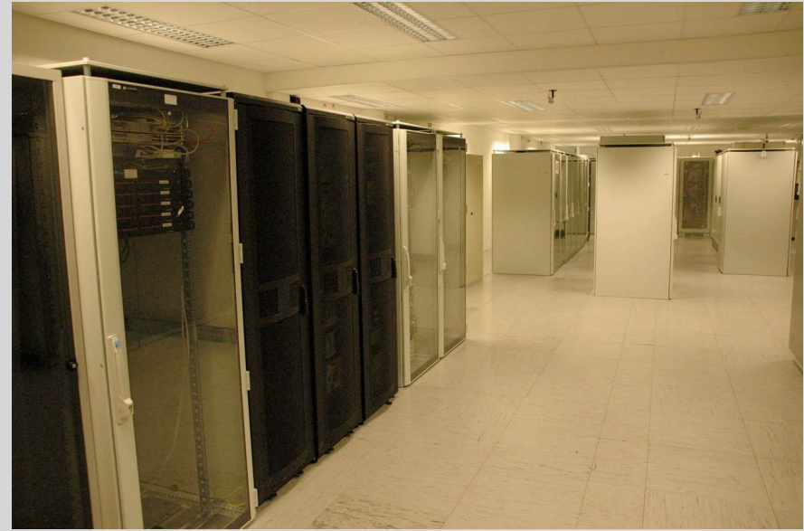
OSS in Production